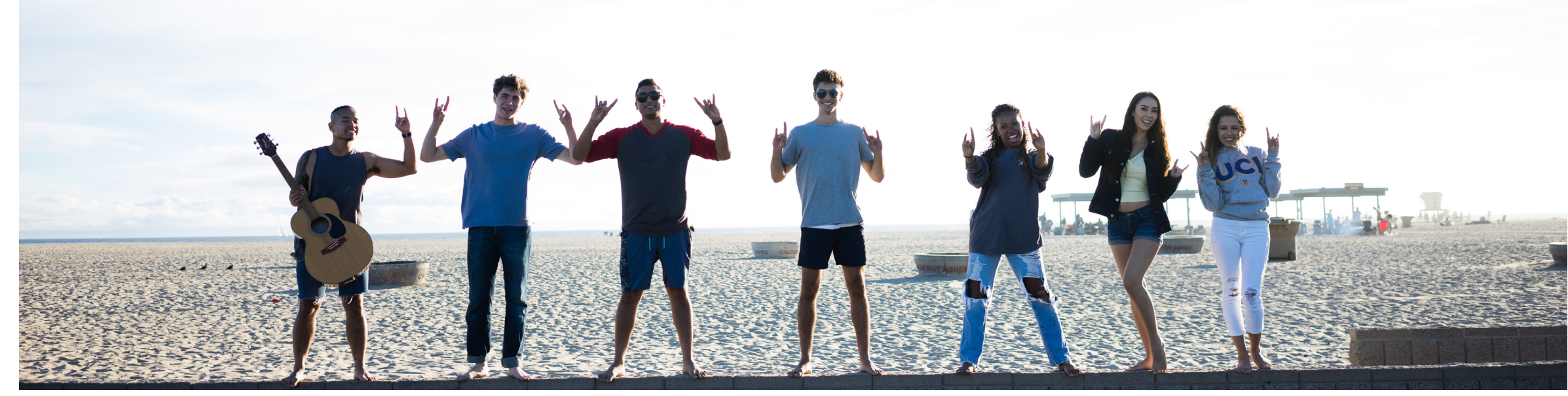
UCI is the #1 ranked university in Money magazine's list of best colleges, the #1 university for beach lovers (also put out by Money), and the #1 university doing the most for the American dream, ranked by the New York Times' College Access Index.